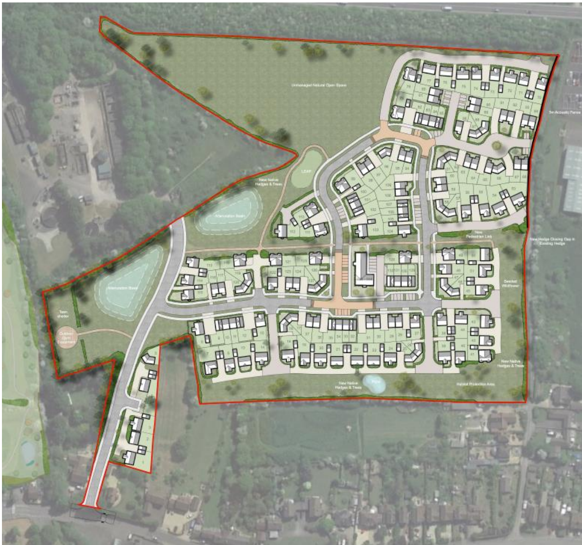
Indicative site layout (Sketch Layout scale 1:2000 dwg no. 001 rev L)

The proposal is an outline application for the erection of 144 dwellings, following receipt of amended plans, with all matters reserved except the means of vehicular access. Access to the site would be via Semington Road which is located to the west of the site. The existing access to the Bowerhill Sewage Treatment Works would be re-routed to use this new access. The areas left for future determination under a reserved matters application would include the appearance of the buildings, layout of the proposed development, scale of buildings proposed and landscaping details. The proposed sketch plan below shows an indicative layout of the site: