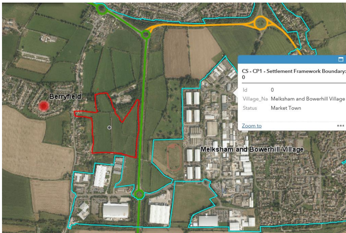
Application site adjacent Berryfield, Melksham and Bowerhill